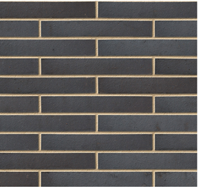
Blue Brick with dark buff mortar