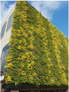
Vertical green wall