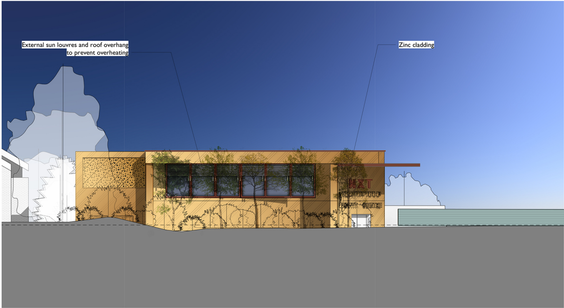
2 South 1 : 100