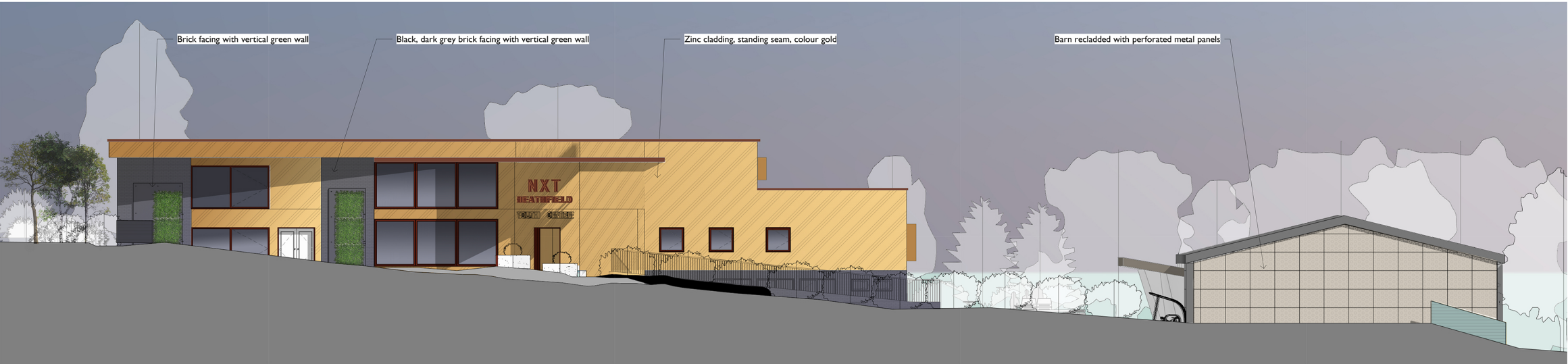
1 East 1 : 100